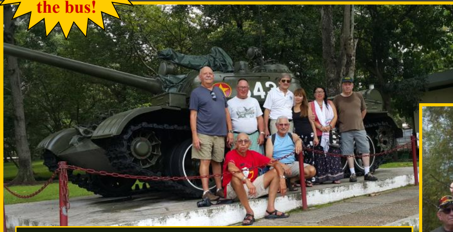
Above: Touring Saigon. Right: GEN Peter Pace, USMC former CJCS shows where it went down. Below: Vietnam will be in a happy Christmas mood.